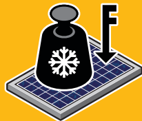
ROBUST AND DURABLE DESIGN