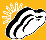
OPTIMIZED FOR ALL SUNLIGHT CONDITIONS