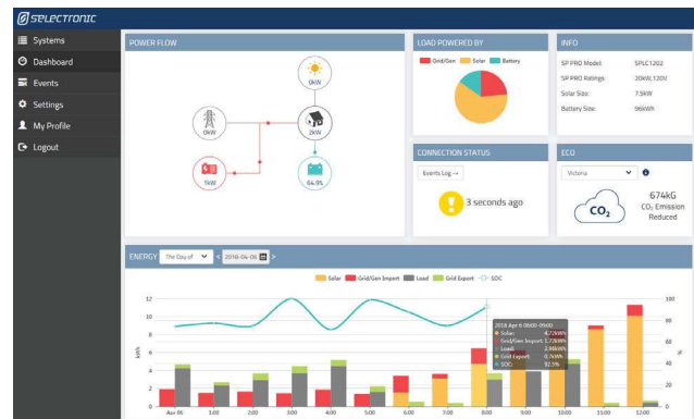
On-Grid System With Generator